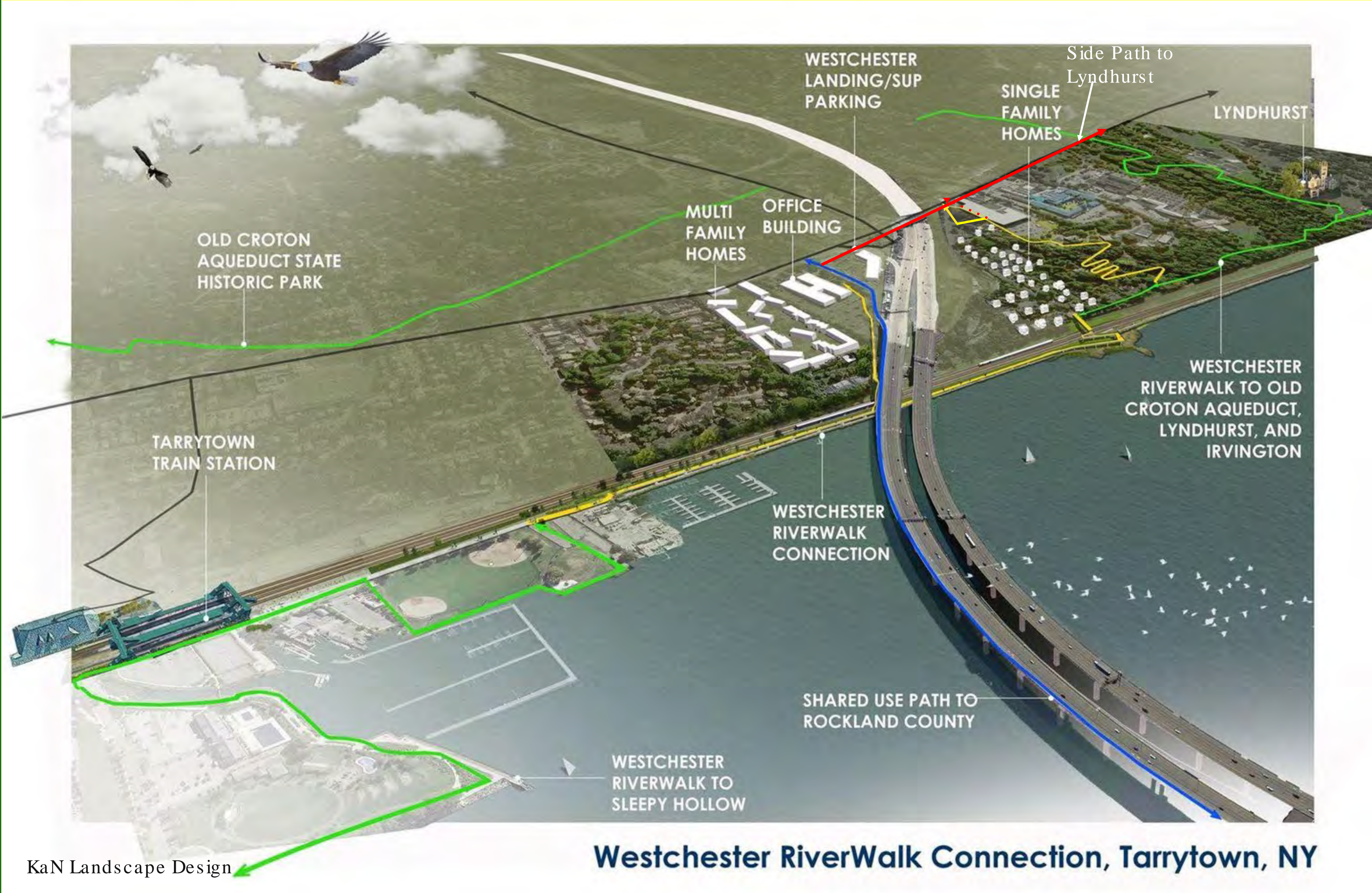
Westchester RiverWalk Connection, Tarrytown, NY