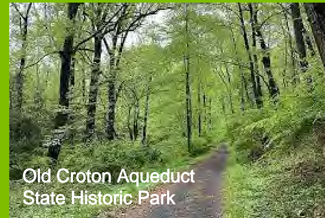
Old Croton Aqueduct State Historic Park