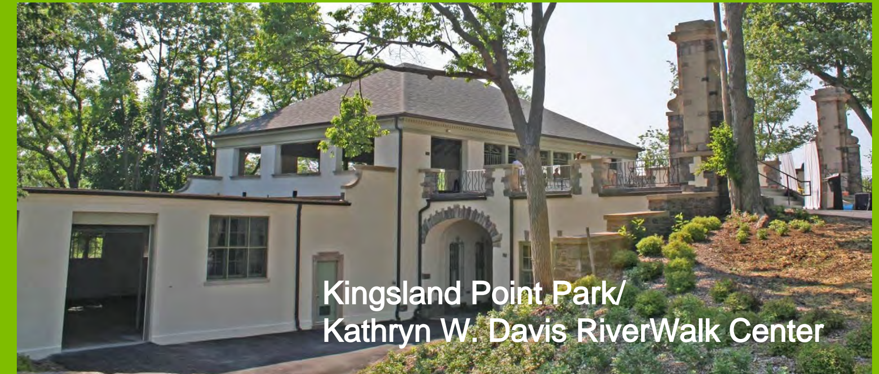
Kingsland Point Park/ Kathryn W. Davis RiverWalk Center