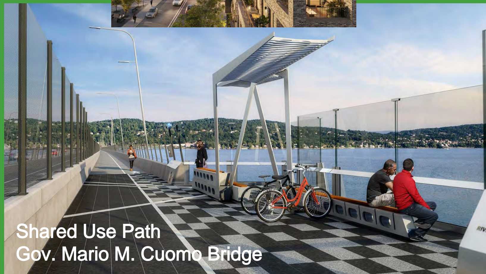
Shared Use Path Gov. Mario M. Cuomo Bridge