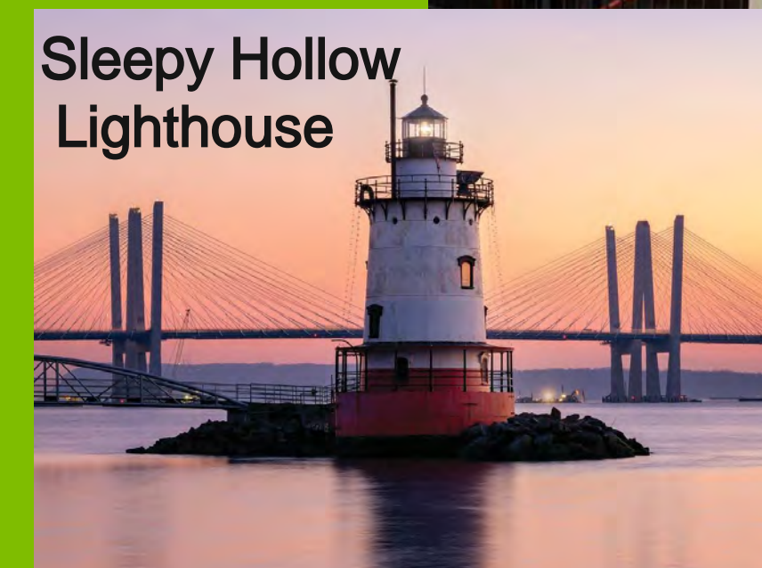
Sleepy Hollow Lighthouse