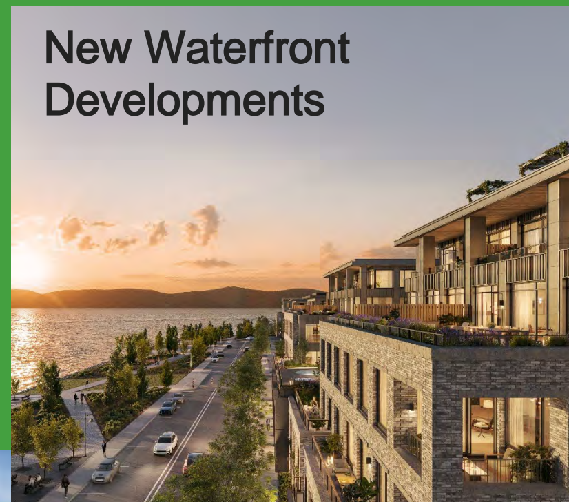
New Waterfront Developments