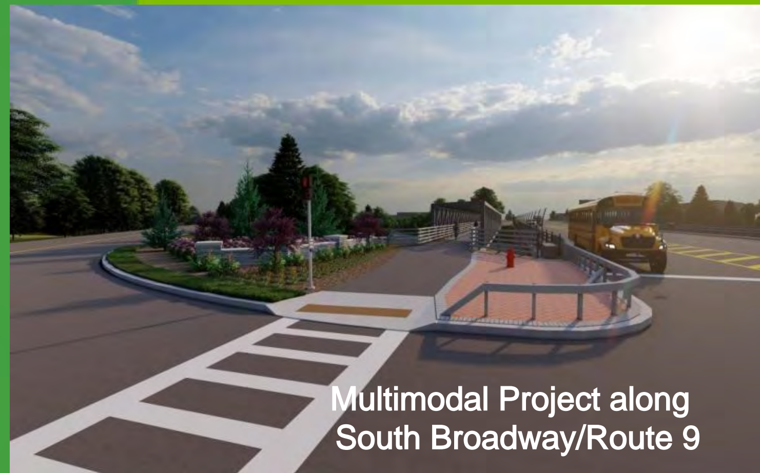
Multimodal Project along South Broadway/Route 9