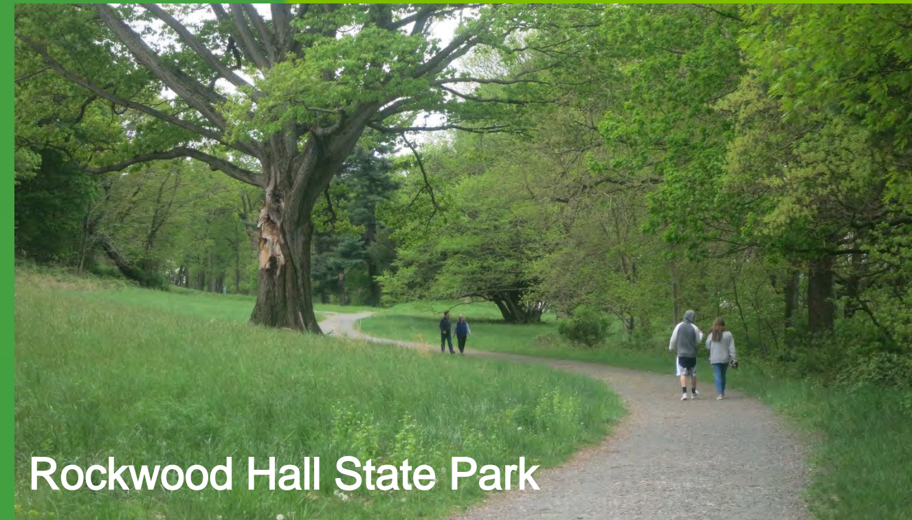
Rockwood Hall State Park