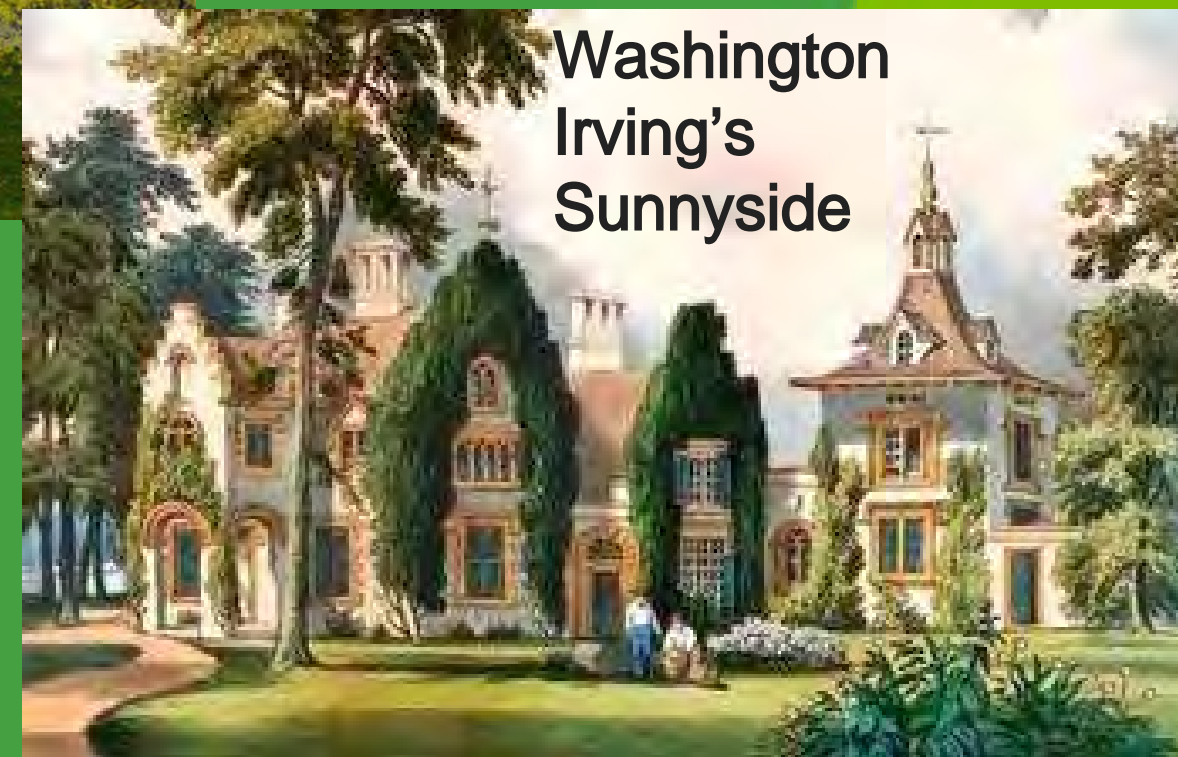
Washington Irving's Sunnyside